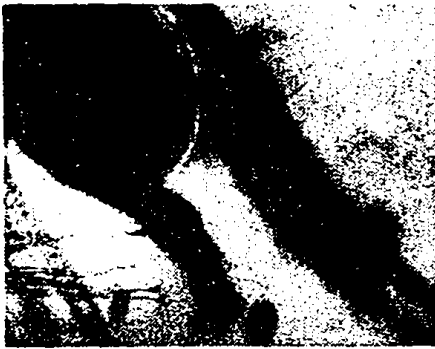
Fig 1 c