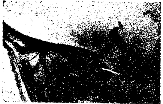
Fig 1 b