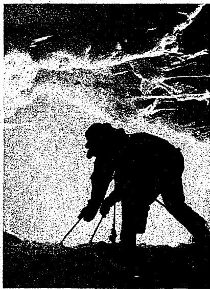
A member of a rescue team scales the wall of a crevasse at New Zealand's Scott Base. Scaling techniques are perfected in case someone crashes through the ice—an ever-present danger with crevasses in Antarctica

An agreement was drawn up by the 12 countries at the conclusion of the International Geophysical Year (IGY), 1957-58. The IGY agreement through the Antarctic Treaty in 1961 made the 12 countries suspend all further territorial claims and hold in abeyance all earlier claims. Seven of the coun-