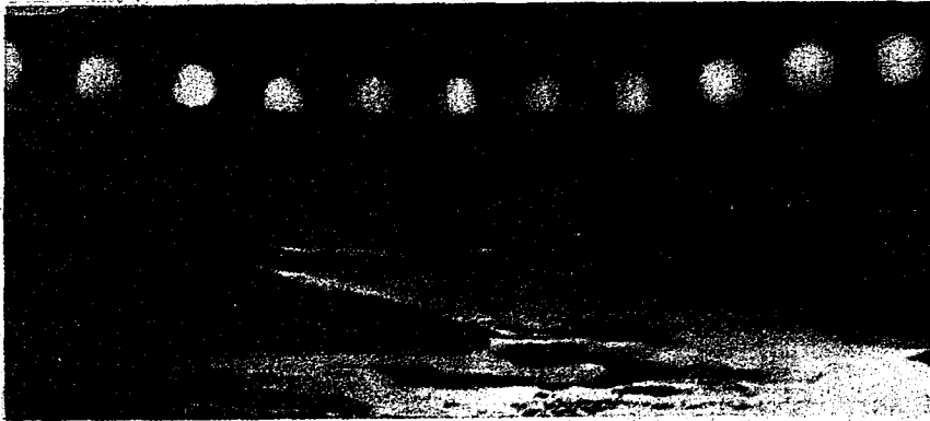
This time-exposure photograph, taken at Japan's Showa Base in Antarctica shows the up-and-down movement of the never-setting mid-summer Sun at the South Pole