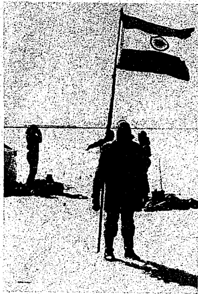
Dr. S. Z. Qasim unfurls the Indian flag on Antarctica

The continental shelf is very narrow but deep. It is about 4 million sq km in area and about 900 m deep. It is less than 200 km wide around East Antarctica, while it is 300-400 km wide around West Antarctica with an average depth of 500 m. Sea ice covers the entire shelf for nine or ten months of the year. During the austral summers, much of this ice breaks down to pack ice which moves northward leaving the open sea above the shelf. The thick ice of several years accumulation in the Amundsen, Bellingshausen and Weddell Seas makes ship movements very difficult. Two major circumpolar currents called the West Wind Drift (easterly) and the East Wind Drift (westerly) maintain the surface circulation of the waters of the Southern Ocean. Vertical movement of water masses also takes place and is caused by differences in salinities. The temperature of the cold, low salinity coastal waters of lower latitudes interact with the warm, high salinity waters of low latitudes at the Antarctic Convergence Zone or