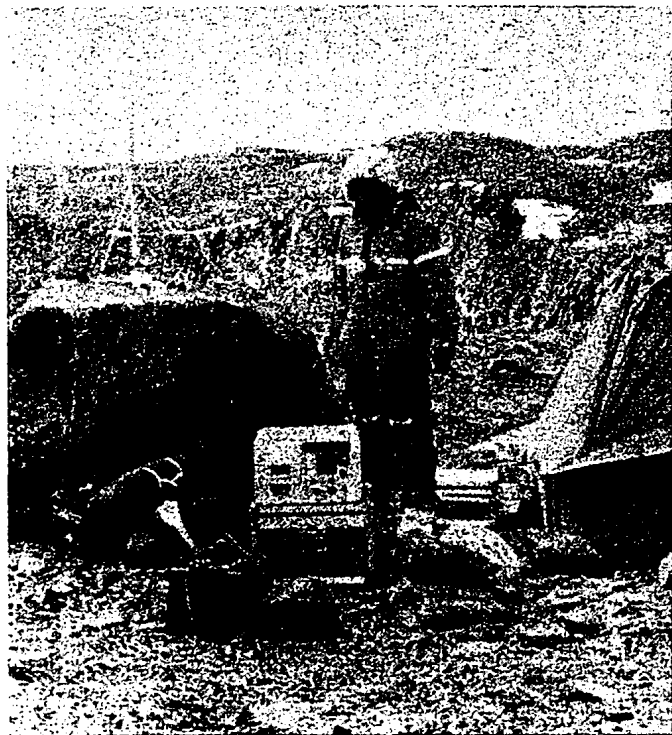
Instruments put up at Dakshin Gangotri by the first Indian expedition to study the weather

Exploration for hydrocarbons (oil and gas) is active in the offshore regions of southern Argentina, South Africa, Australia and New Zealand. These discoveries offer hopes for possible exploration, since the existence of similar hydrocarbon-bearing strata are