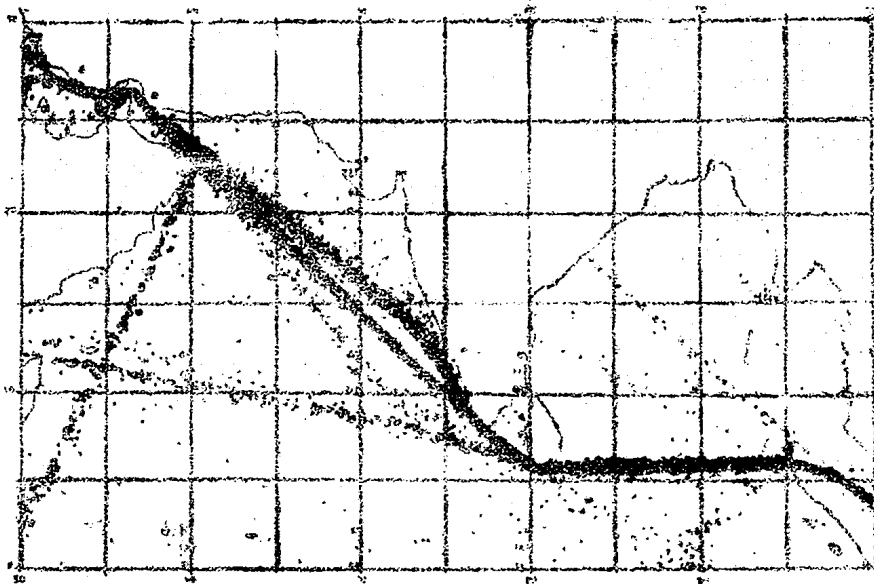
fig. 2. Points of observation on oil slicks and other floating pollutants in the Northern Indian Ocean

northern Indian Ocean, particularly the Arabian Sea is a place for intense occurrences of oil slicks. It also leads to suggest that the source of these oil slicks is the bilge washings of the ships on their way to the Gulf ports which is reflected in higher percentage frequency in oil sightings; as, so far, tanker disasters have been rare in this region.