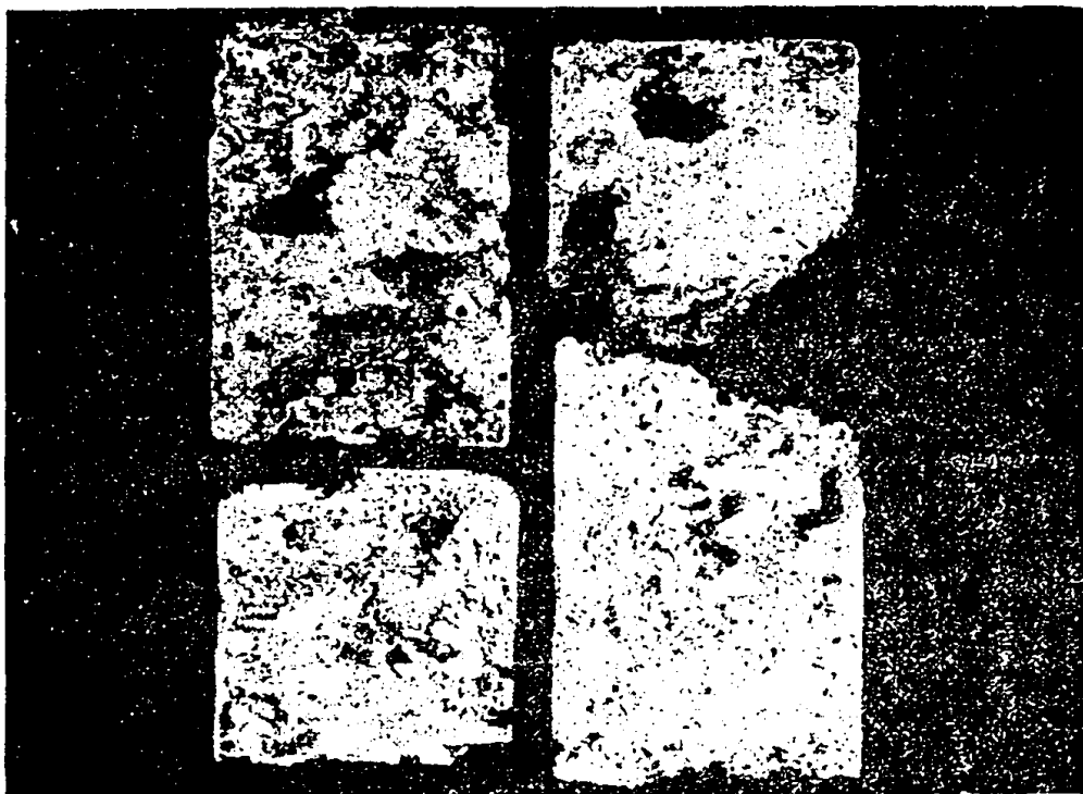
Fig. 1. Condition of the panels of Experiment II after 337 days; A : treated with 'chandrus' and lime in karanjel oil, B : treated with 'chandrus', lime and copper sulphate in karanjel oil; C : untreated control.

monly used by the fishermen. Experiments were therefore, conducted to study the effectiveness of this method against settlement of marine organisms and results obtained from treated wooden panels have been presented in this paper.