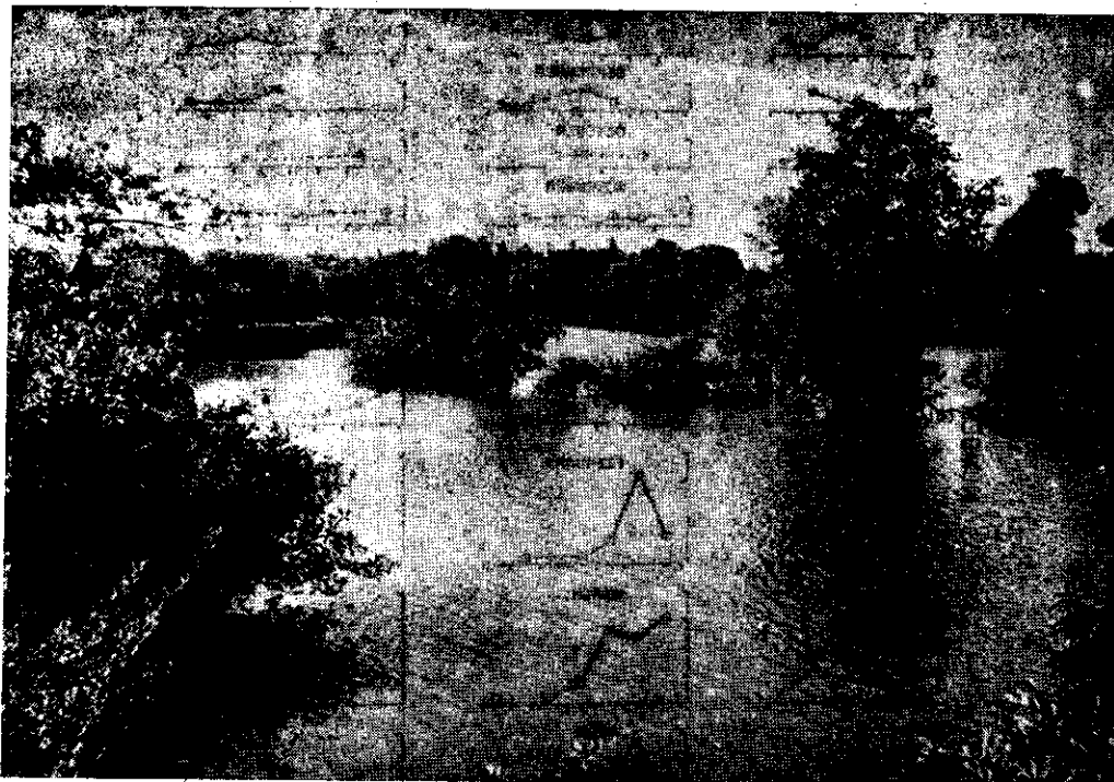
Fig. 1. Study area.

Growth: Growth was studied by length-frequency method. Progression of modes was traced from 10-20 mm in all the species. M. dobsoni attains a maximum size of 50-60 mm in 5 to 6 months, whereas M. monoceros stays in this environment for 7 to 8 months and attains a relatively larger size of 70-80 mm