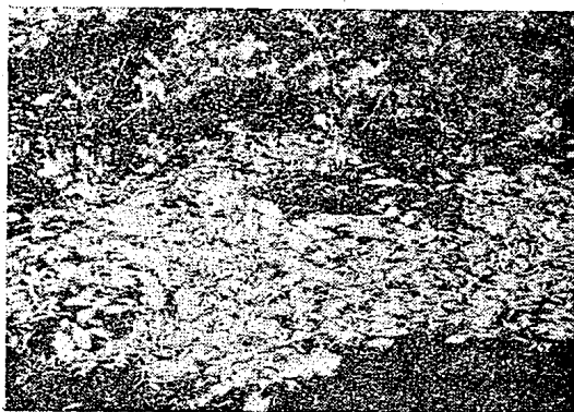
Fig. 2 The affected fishes

Table 1 and Figures, 1, 2 and 3 show the species affected. Some specimens of Eteroplus suratensis , Scatophagus argus and Belone sp.,