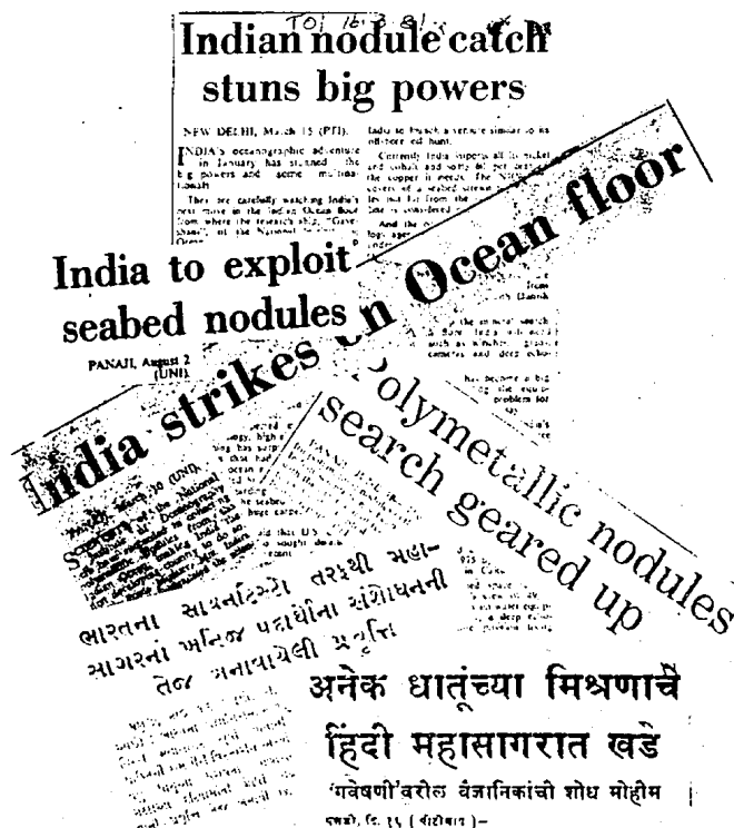
Fig. 5 Press Headlines.

In addition to "RV Gaveshani" and "ORV Sagar Kanya" three other vessels were chartered by the Department of Ocean Development to accelerate the surveys. The NIO deployed a team of 76 scientists and engineers for the survey which perhaps formed one of the largest such teams in the world. The surveys led to the demarcation of the prime area of 300,000 sq. km. with an estimated total tonnage of nodules of about 1335 million. The total expenditure incurred in achieving these objectives was more than Rs. 50 crores. The calendar of important events is given at the end (Appendix III). An application for the Pioneer Area was filed by the Government of India with the United Nations in January 1984 and in July 1987 India became the first country in the world to have been allocated exclusive rights for further exploration work by the Preparatory Commission for the International Sea Bed Authority. Pursuant to this decision, the Secretary General of the United Nations, handed over the Certificate of Registration to the Indian delegation in New York on 17th December 1987 (Fig. 6).