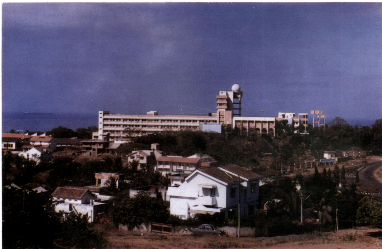
Fig. 1 National Institute of Oceanography

During the 1960's Indian Research and Survey organisations, namely the Geological Survey of India, the Oil and Natural Gas Commission, National Geophysical Research Institute and the National Insti-