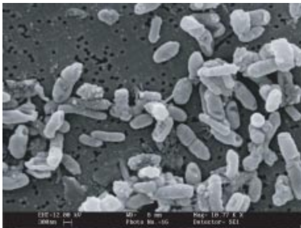
Figure 2. A scanning electron micrograph showing a population of marine bacteria after electrolytically disinfected on membrane filter

environment and microorganisms have long been evolved though this realization is yet to be appreciated widely by of microbial ecologists.