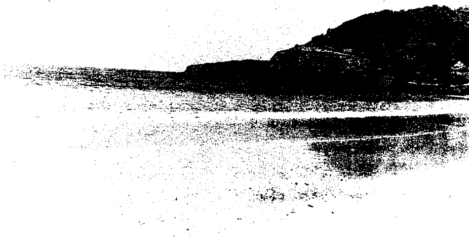
Fig.1a - Laterite table-lands with cliffed coastline

The prominent landforms in the coastal region are the laterite capped table-lands, with a gentle seaward slope and there is usually an abrupt fall along the coast presenting a cliffed coastline (Fig.1a). The climate, particularly rainfall, has played a decisive role in the process of lateritization and