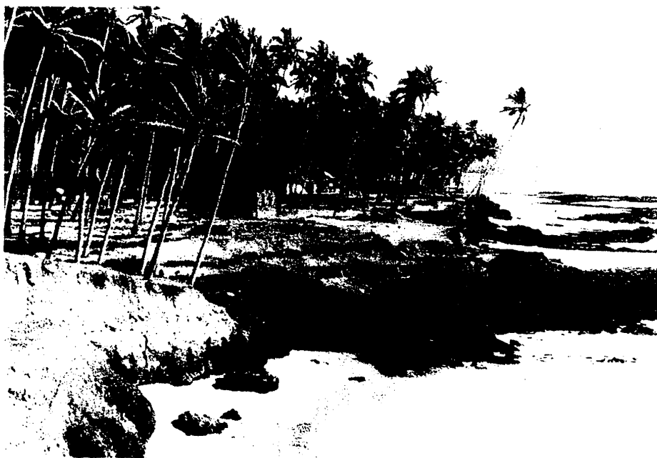
Fig.1b - Abrasion platforms of laterite

The presence of laterite beds forming the abrasion platforms in the intertidal zone (Fig.1b) as well as at a depth of 20 to 34 m below the present sea