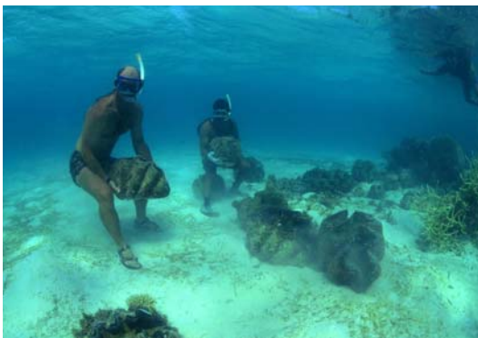
WorldFish Broodstock at Nusatupe Island, Solomon Islands

clams are listed under Annex II of CITES, and are considered vulnerable under IUCN Red List of threatened species. Although there are examples of local extinctions ( T. gigas at Guam and the Mariana Islands, the Federated States of Micronesia, New Caledonia, Taiwan, the Ryukyu Islands and Vanuatu; T. derasa , at Vanuatu; and H. hippopus , at Fiji, Tonga, Western and American Samoa, Guam, Mariana Islands and Taiwan) in most cases giant clams are not eradicated through fishing and habitat change. In