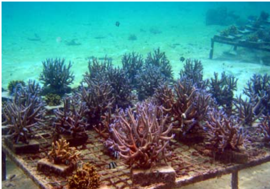
Transplanted corals on artificial frames

be collected, traded or even simply possessed by any individual for whatever be the reason. Pilot studies (and eventually transplantation on large scale) require specific Government approval and supervision at every stage. There are no other issues such as tribal or cultural sentiments or sanitation or trans-border shipment constraints. Permits, however, need to be secured when live corals are transported from one reef region to another. The monitoring involves monthly visits