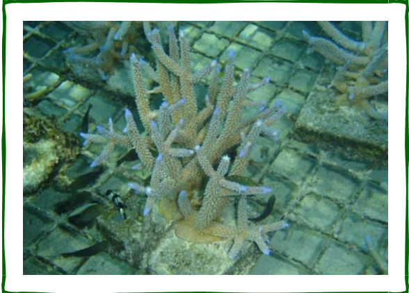
Transplanted coral on frame

to the transplant sites to record linear increase, number of branches formed, mortality, if any, and assessment of the cause of mortality (artisanal fishing practices, boat movements in the vicinity) and overgrowth with algae. Such algal growth is immediately removed. Qualitative assessments of the biodiversity in the vicinity are also made. Photographic records are also made at periodic intervals.