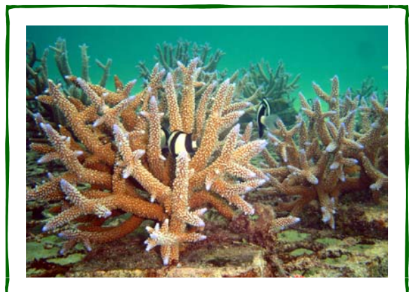
Close up of translocated coral with fish