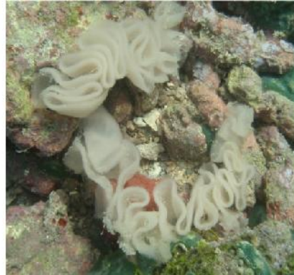
Egg strands of Pleurobranchus forskalii

The two specimens collected for identification were 7cm and 7.8cm in length respectively. The mantle was large, convex with two series of discontinuous white semi-lunar lines marking unevenly distributed tubercles and a siphon in the posterior region. Rhinophores are hollow and cylindrical. The foot is little larger than mantle with dark spots in the ventral side. It was dark purple in colour, whereas, other individuals from the sampled area showed much colour variation, from peach to dark brown or purple. Pleurobranchus forskalii was first described by Rüppell & Leuckart during 1828 based on the specimen deposited in the Frankfurt Museum collected from Red sea. The specimens examined closely resembles with the description of Rao and Alagarwami (1960) which was up to genus level collected from the same area. The present observation corroborate as Pleurobranchus forskalii and found as new record for Indian coastal waters.