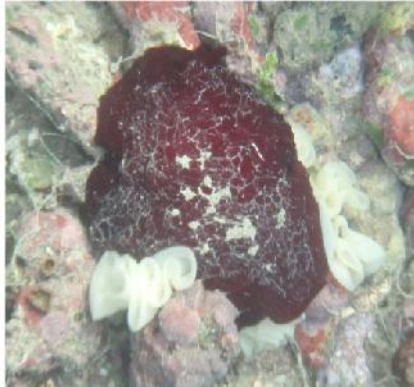
Spawning of Pleurobranchus forskalii