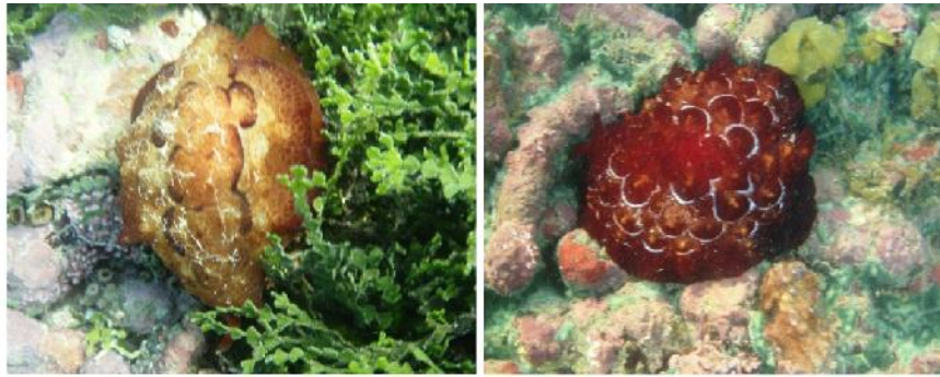
Pleurobranchus forskalii with different colour morph