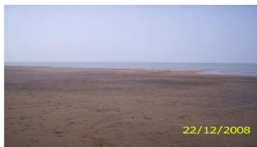
Fig 2. Field photos showing the deposition at the spit

Ekakula spit (Fig. 2) is an extension of the Gahirmatha coast at the Maipura river mouth. This elongated spit extending towards north from Ekakula owes its origin mainly to the deposition of sediments brought by the northerly long shore sediment transport from south and partly to the sediments deposited by the Maipura-Dhamara river system 8 . A close inspection of the temporal satellite images of the area (Table 1) reveals the progressive evolution of the spit. This spit was visited during the field trip in December 2008 (Fig. 2). Spit appears to have undergone growth and fragmentation over the years and accordingly the Maipura river mouth shifted back and forth. Growth of the spit forces the river to shift its mouth and the river causes fragmentation by breaching the spit during heavy floods and cyclones 9 .