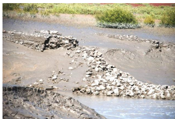
Fig. 5—Remains of a port at Vavaniya in the little Rann of Kachchh