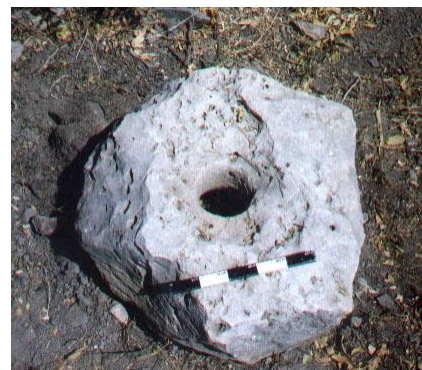
Fig. 4—Protohistoric Stone anchor from Kindar Kheda