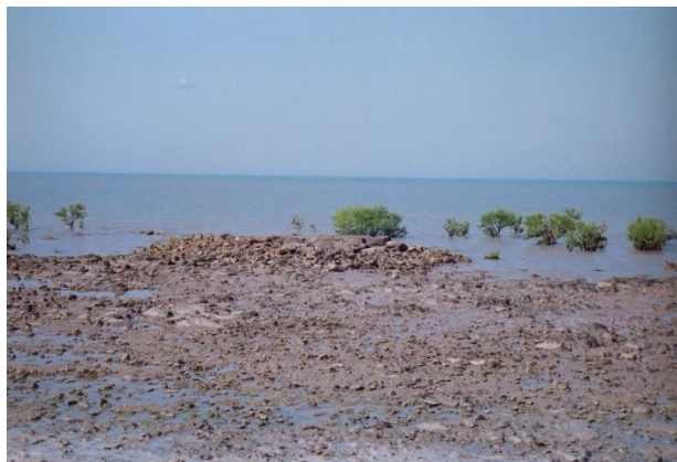
Fig. 2—Remains of a medieval period temple exposed during low tide off Pindara

Excavations at Bet Dwarka Island have yielded a rich antiquity concerning the exploitation of marine resources by ancient mankind 19 . The habitation was spread in a vast area (more than 2 km) along the southeastern coast and major parts of the ancient