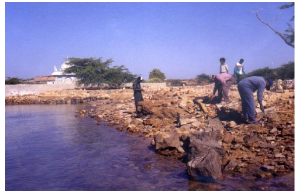
Fig. 3—An Early historic site exposed during low tide in Bet Dwarka island

The village of Kindar Kheda is situated about 20 km northwest of Porbandar. The archaeological site is under cultivation, and is located on the eastern side of the village. A Sun temple dating back to the 9 th century AD of the post-Maitraka period is situated here 20 . The southern part of the site is a low-lying area. Archaeological investigations have yielded a