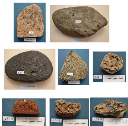
Fig. 2. Pumice-like clasts of different size, shape and colour, collected from beaches off Goa and Karnataka.

Pumice collected from beaches can be categorized under two size classes. One is of large dimension (samples VD-1, VD-2 and VD-3) and other is of comparatively smaller size (samples AM-1 to 9). In general, their size varies between 4.3 cm to 32 cm (Fig. 2). Their colour varies from light brown, reddish brown and grey, and the clasts exhibit different shapes. Two artificial industrial pumice of white and sky blue colour and a sample (photo) of foam glass 9 are also shown (Fig. 3). Judging from their physical features, color, shape, density and external morphology, the clasts collected from beaches have all characteristics of natural pumice.