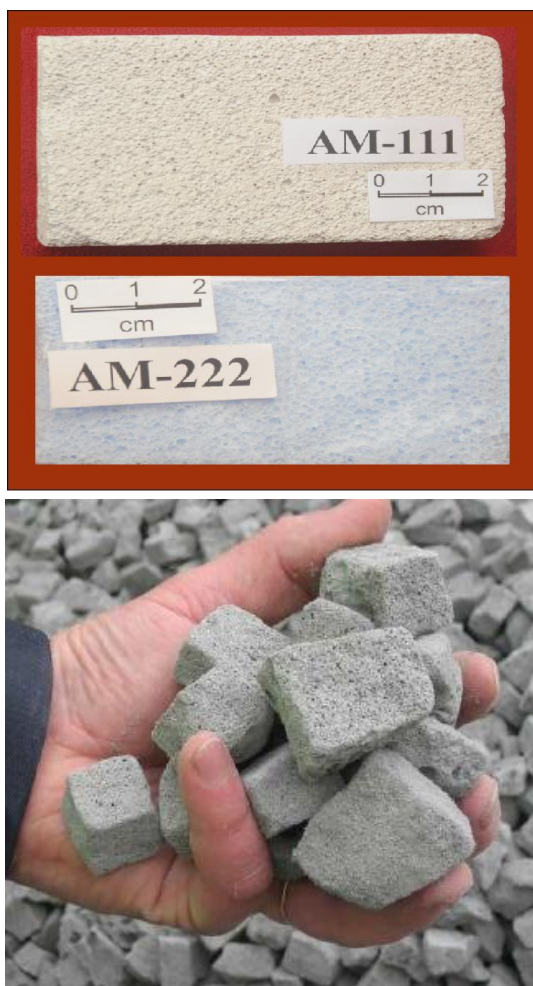
Fig. 3. Samples of artificial pumice available in the market (top); photograph of foam glass from Foamit® report ( www.uusioaines.com ) (bottom).

The chemical composition of six beach pumice analysed by XRF is presented in Table 1. The fragments exhibit very wide variation in the contents of SiO 2 (69% to 93%), Na 2 O (0.2% to 13%), Al 2 O 3 (0.08% to 6.8%), K 2 O (0.1% to 2.3%), Fe 2 O 3 (0.3% to 6.3%), MgO (0.3% to 3.8%) and CaO (0.5% to 5.9%). Such large differences in elemental composition is not expected in natural pumice clasts originating /erupted from an explosive volcano. Total REE content varies considerably from 32 ppm to 422 ppm.