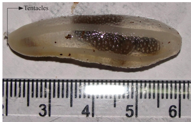
Fig. 2. Photograph of Protankyra bidentata at its dorsal position

Records of the genus Protankyra are mainly from Pacific Ocean and from the North-east Atlantic (data from GBIF Open Geospatial Consortium Services). In Indian Ocean, occurrence of Protankyra was reported mainly from Bay of Bengal, along the east coast of India. The first report of Protankyra from Indian region was that of P. errata by Koehler and Vaney (1905). James (1982) described P. tuticorenensis from Tuticorin and later Singh and Choudhari (1992) reported P. similis . According to the information provided by the CSIR-National Institute of Oceanography (CSIR-NIO), India, altogether eight species of the genus Protankyra were reported from Indian region (NIO bio Search, 2015) viz., P. errata , P. timida , P. conferta , P. tristis , P. innominata , P. tuticorenensis , P. similis and P. pseudodigitata . Protankyra bidentata (Woodward & Barrett 1858) is reported here for the first time from Indian Ocean. P. bidentata has so far been reported from China and Japan (Clark and Rowe, 1971; Yokoyama et al. , 2009), from Bohol in Philippines as junior synonym Synapta molesta (Semper, 1868) and also from Korea (Paik et al. , 2008).