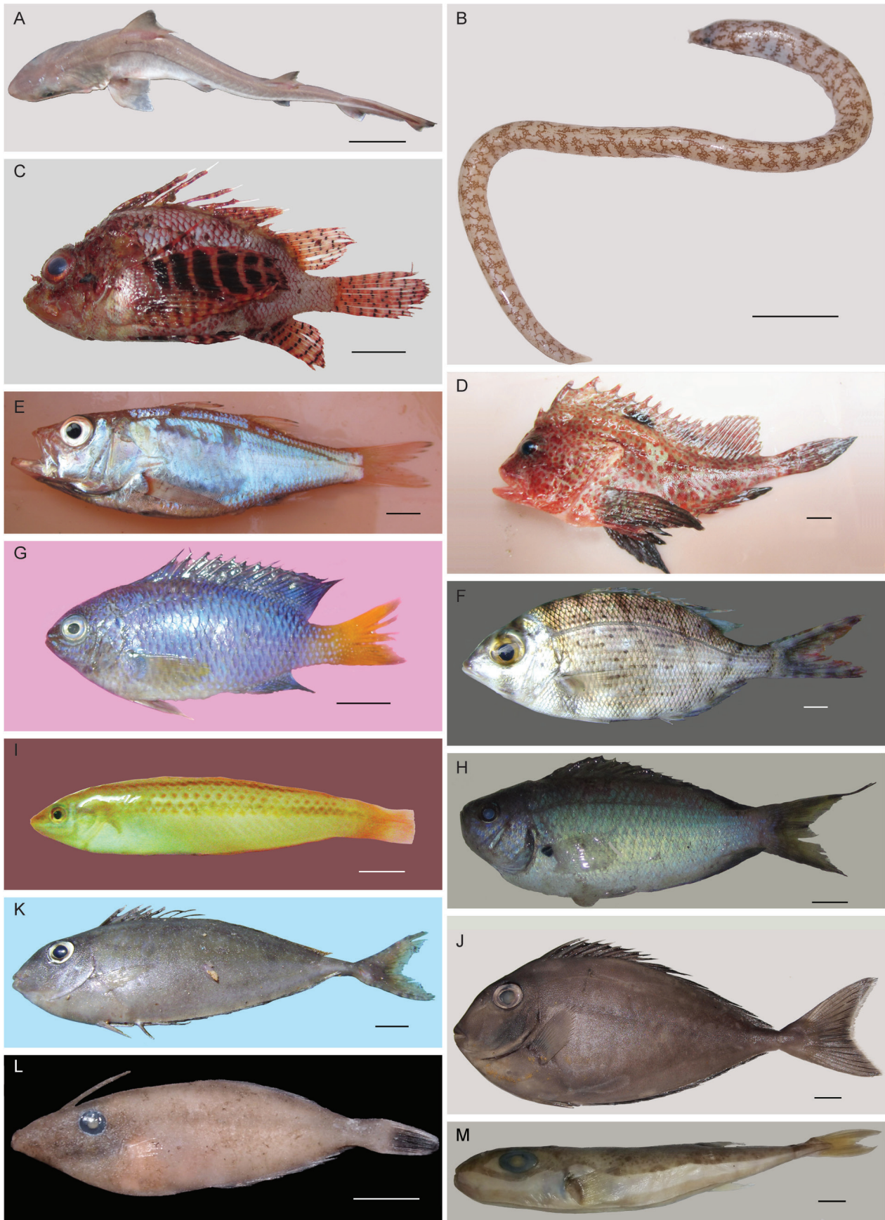
Fig. 2. Lateral views of newly recorded fishes from Gulf of Mannar: Hypogaleus hyugaensis (A), Uropterygius micropterus (B), Dendrochirus bellus (C), Snyderina guentheri (D), Acropoma japonicum (E), Gymnocranius elongatus (F), Pomacentrus similis (G), Pristotis cyanostigma (H), Leptojulius cyanopleura (I), Naso annulatus (J), Naso thynnoides (K), Pseudalutarius nasicornis (L), Lagocephalus suezensis (M); Scale bars: 5 cm (A); 1 cm. (B–M)