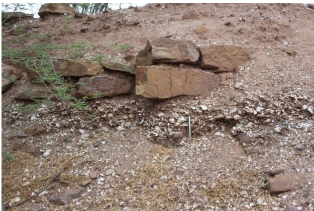
Fig. 3 — Bambhanka on a seasonal stream about 15 km south of Dholavira site