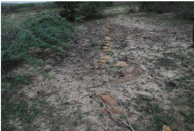
Fig. 2 — Jhandiasar on a seasonal stream about a km from the Rann and about 4 km north of Dholavira site.

A small Harappan site was noticed in 1990 on the northern shore of Khadir Bet 6 (Rao, 1992) which is about 4 km north of the Harappan site of Dholavira. However, through coastal route, it is about 14 km from Saran coast to Dholavira coast. The site is on