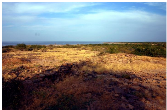
Fig. 4 — Archaeological remains at Saran on the northern coast of the island about 3.5 km from Dholavira site.