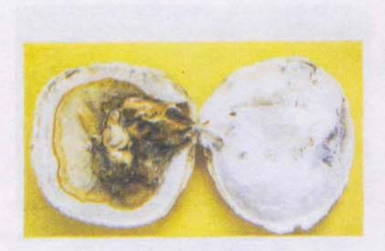
Plate 64. Specimen of Placuna placenta