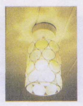
Plate 65. A lantern made from Placuna placenta shells