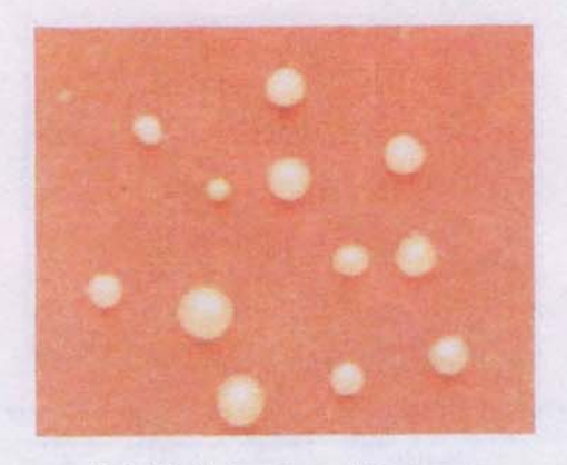
Plate 67. Various sizes of intact pearls.