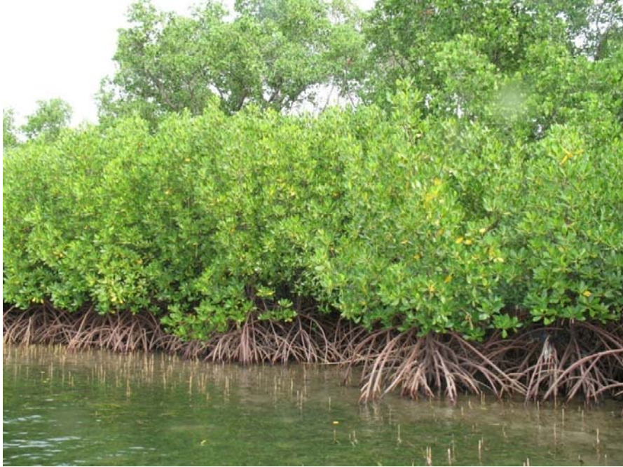
Figure-3: Typical mangrove vegetation of Chora Island, Mandovi River showing tangled prop roots (after Forest Department of Goa: https://www.forest.goa.gov.in/mgr/ ).