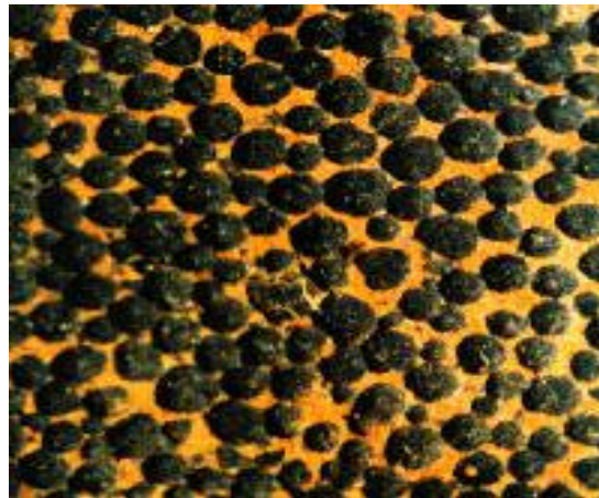
Fig. 1: Polymetallic nodules on the seafloor

This program has resulted not only in assessing the potential impacts of deep seabed mining and generating environmental data, but also in capacity building for multi-disciplinary oceanographic research, recognition to Indian efforts in this field and providing advisories to national and international regulatory agencies.